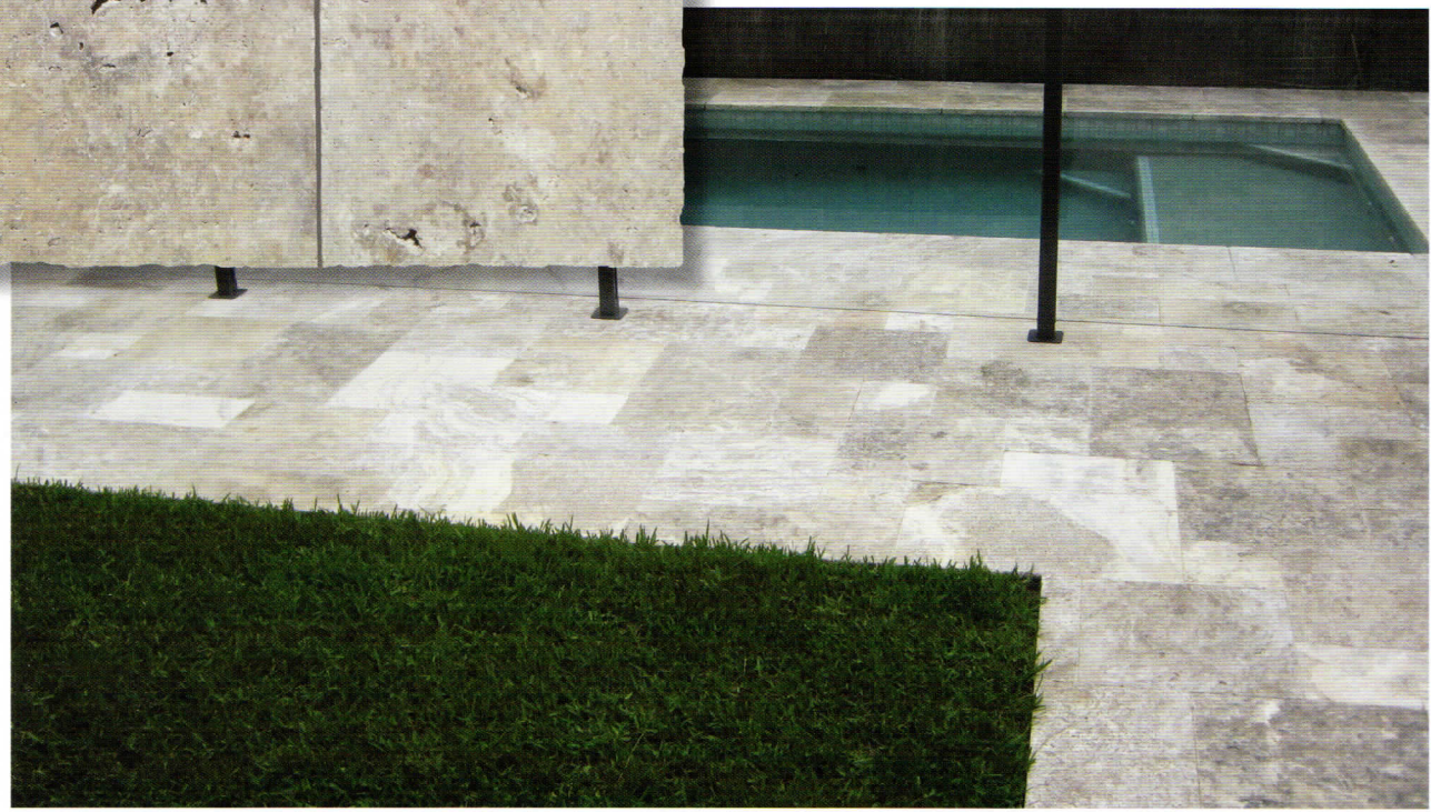
This pool uses 600 x 400 x 30mm Tumbled and Unfilled Square Edge Coping. The surround paving has been completed using the 'French' pattern tiles.

Photo illustrates typical shade variations and imperfections found in all natural stone tiles.