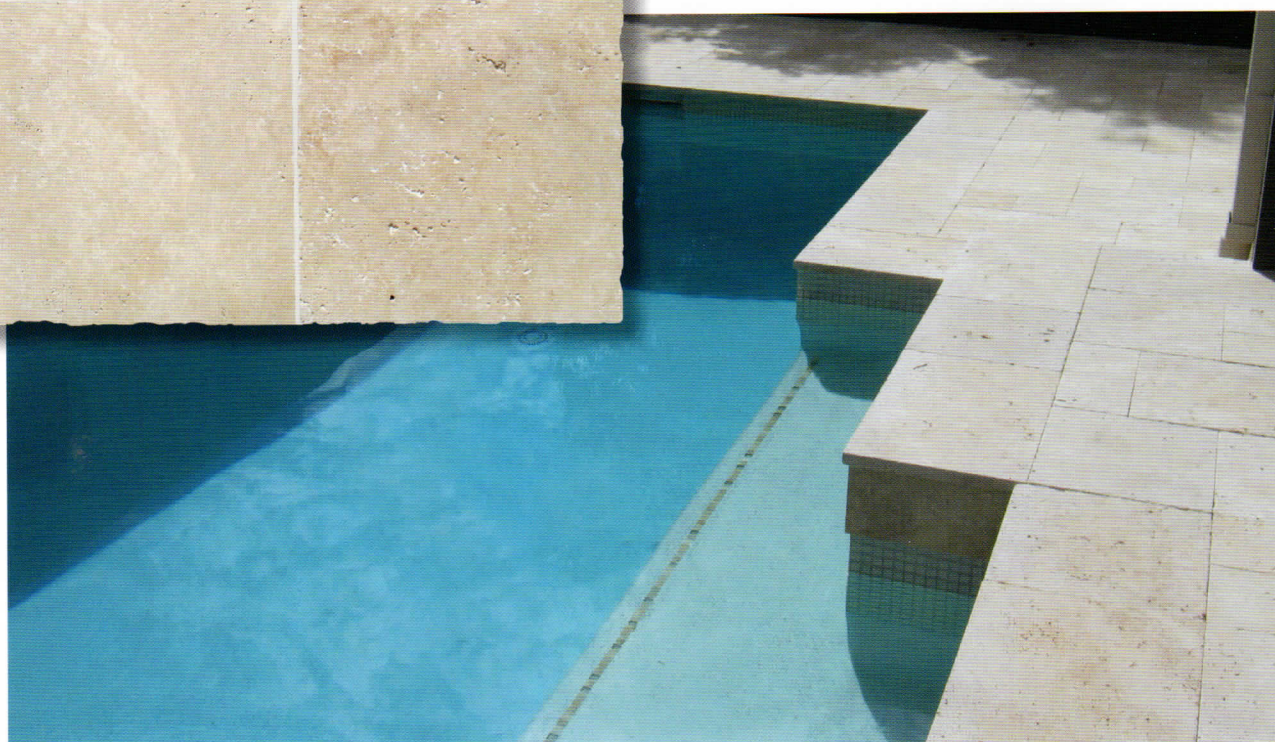
Photo illustrates typical shade variations and imperfections found in all natural stone tiles.

This pool uses 600 x 400 x 30mm Tumbled and Unfilled Square Edge Coping. The surround paving has been tiled in the 'French' pattern. GCR300 Marble Glass Mix Light 23mm crystal glass mosaics have been used for step markers. GCR150 Ivory crystal glass mosaics 23mm have been used on the waterline.