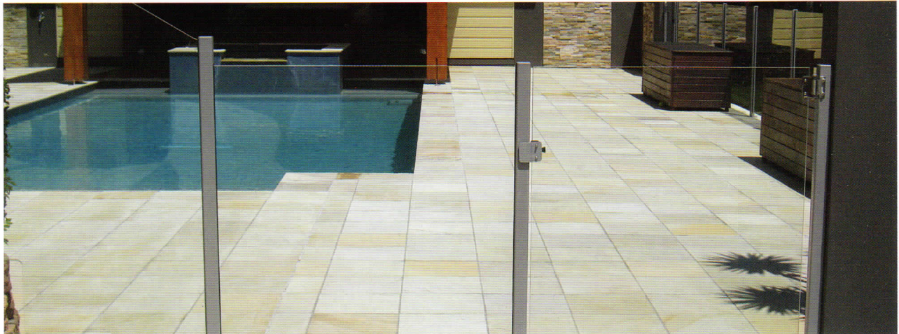
'Natural Mint' Himalayan Quartz 400 x 400mm has been used on the coping and surround paving.

Photo illustrates typical shade variations and imperfections found in all natural stone tiles.