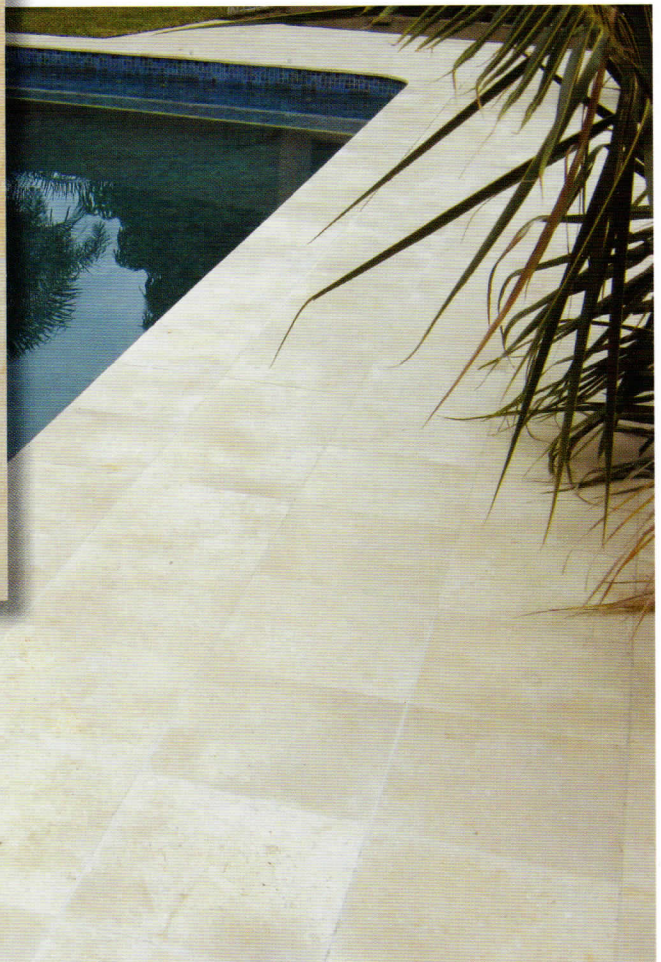
This pool features 400 x 400 x 20mm Crema Limestone in an 'Antique' finish. The coping tiles have been cut to fit around the curves of this renovated pool.