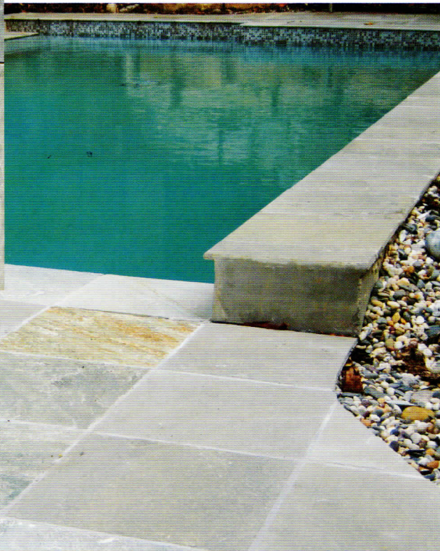
GC480 Tempest Glass Mosaics have been used on the waterline of this pool. Grey Gum Quartzite has been used on the coping and surround paving.

Photo illustrates typical shade variations and imperfections found in all natural stone tiles.