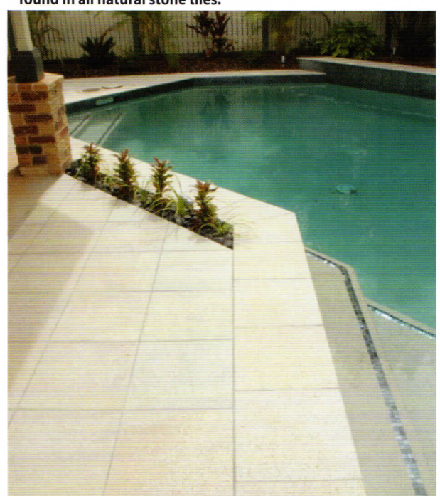
GC102 Charcoal Pearl glass mosaics 20mm have been used on the waterline and for step markers. 400 x 400 x 20mm Square Edge Coping has been used on the edge of the pool.

Custom Orders: Other sizes available - allow 8 - 10 weeks from order. Photo illustrates typical shade variations and imperfections found in all natural stone tiles.